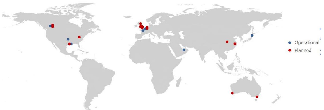
Figure 3 Hydrogen production with CO 2 capture is coming online [5] .

Low-carbon hydrogen from fossil fuels is produced at commercial scale today, with more plants planned. It is an opportunity to reduce emissions from refining and industry.